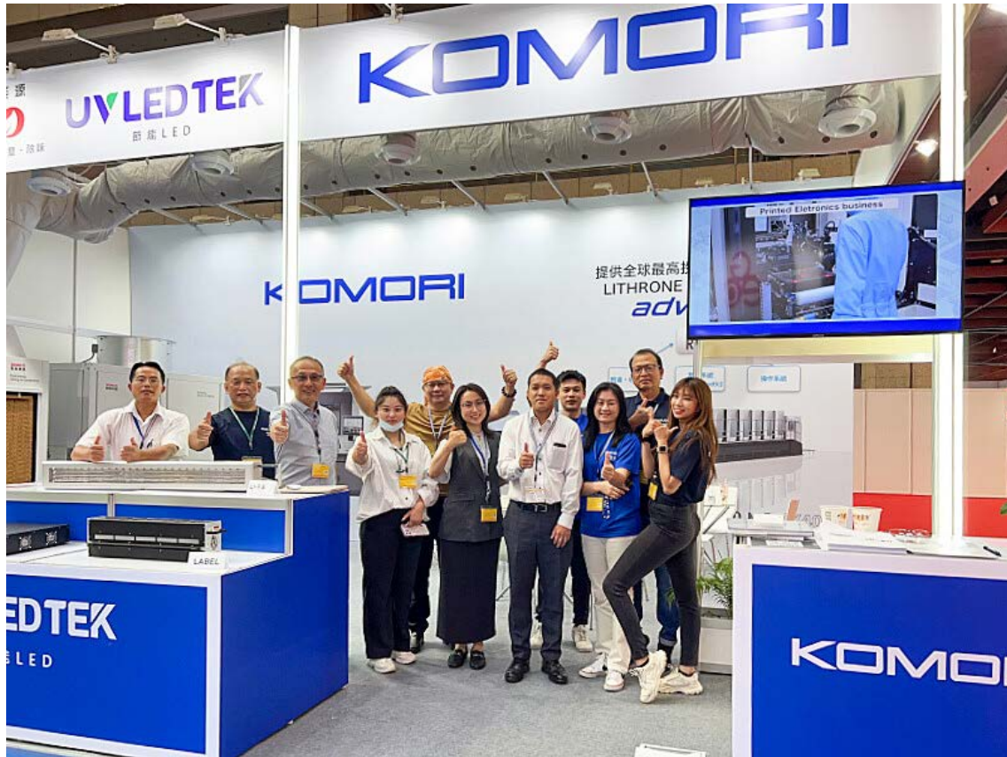
TIGAX 2024 Komori Taiwan team