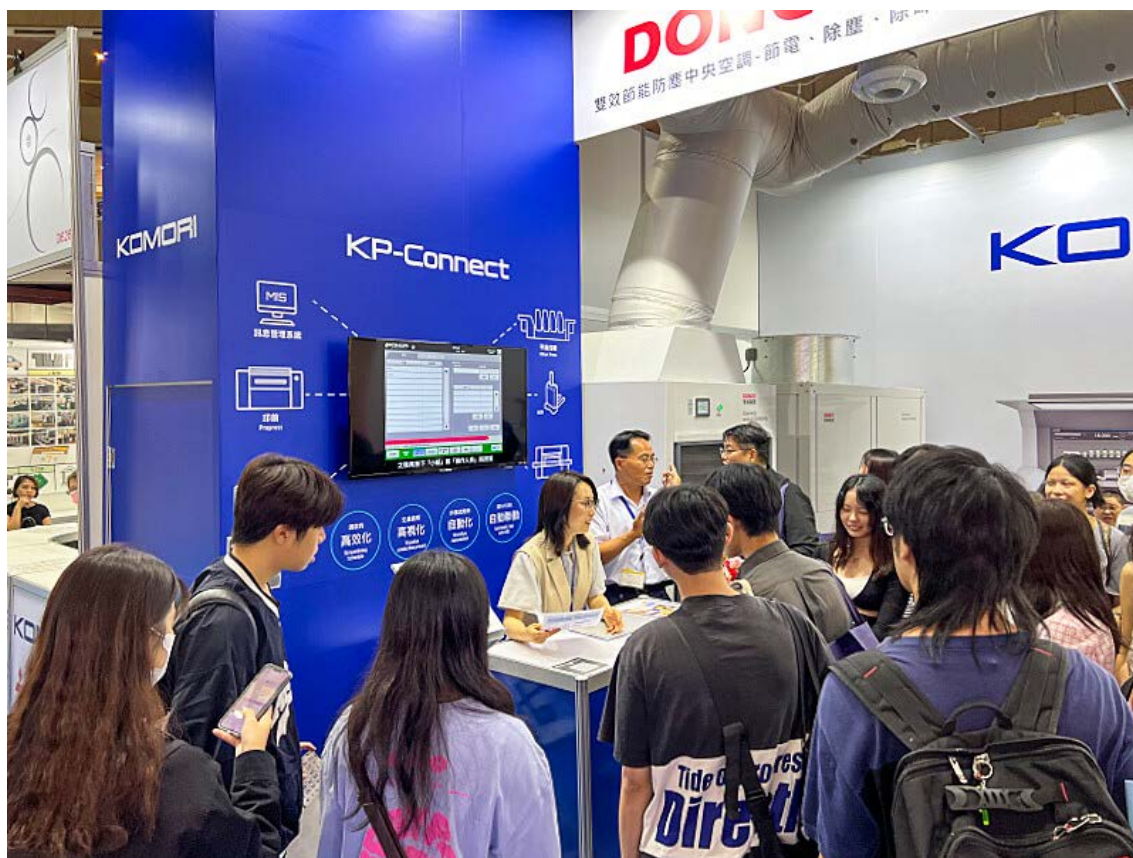
Introducing KP-Connect Basic to group visitors

KP-Connect: The system developed by Komori that can improve printing processes to solve the manpower shortage in printing factories. A questionnaire was developed to determine the need for KP-Connect in the Taiwan market, and the very good response showed that customers need this system.