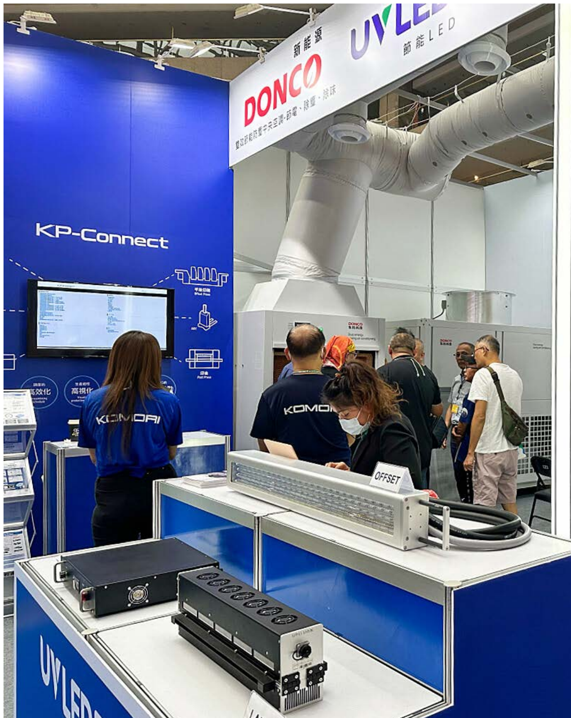
Prospects assessing the performance of the air conditioning system